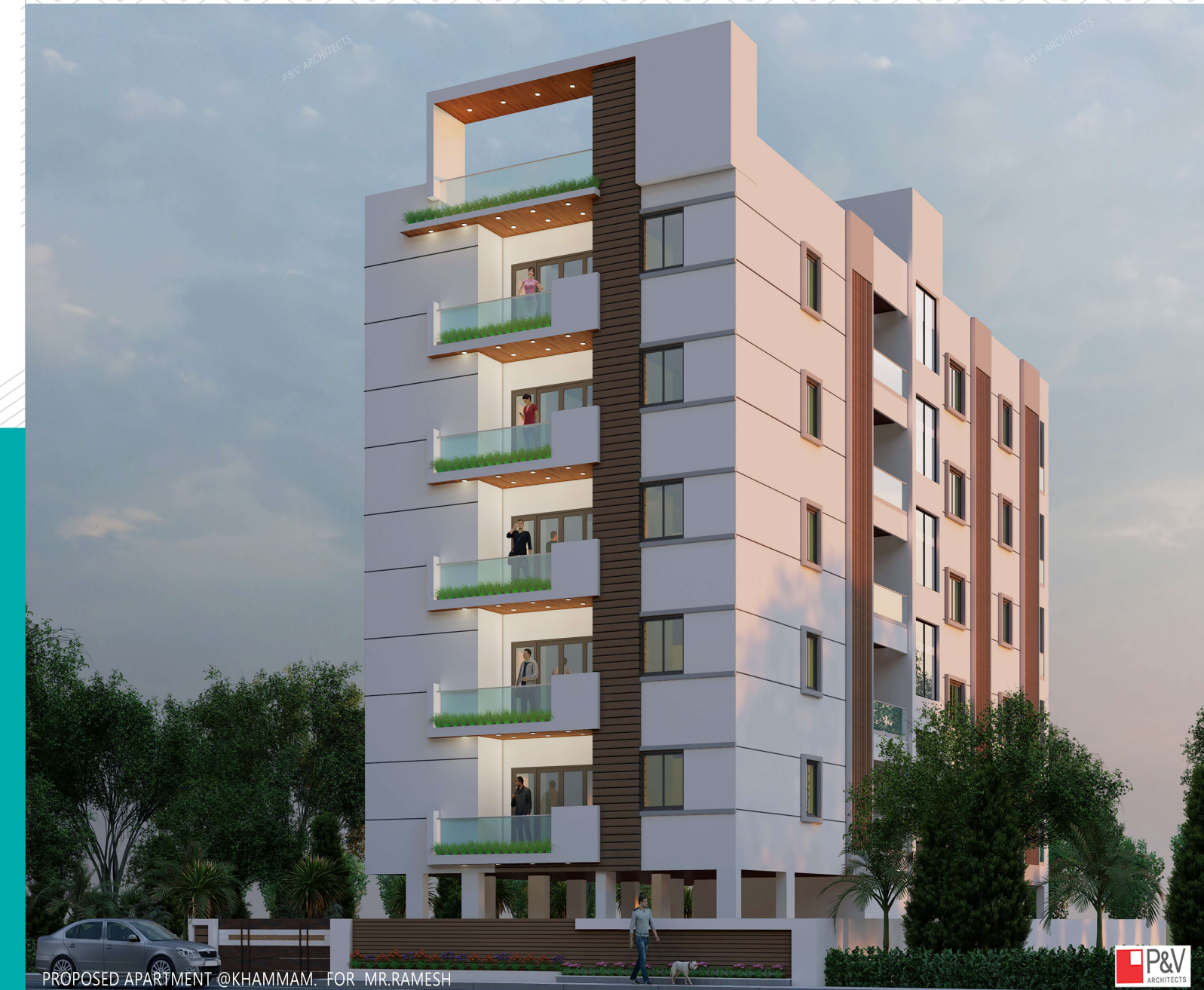
PROPOSED APARTMENT @KHAMMAM. FOR MR.RAMESH