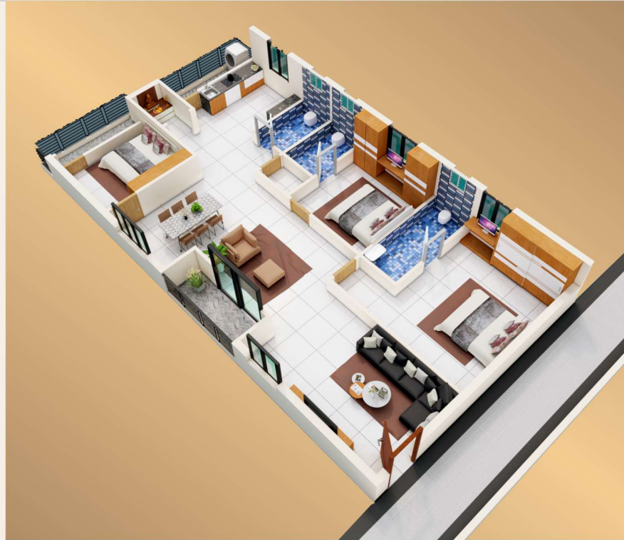
F NO. 01 - 1820 SFT - 3 BHK - EAST