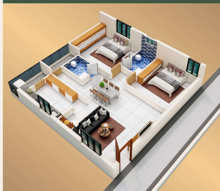
F NO. 05 - 1190 SFT - 2 BHK - NORTH