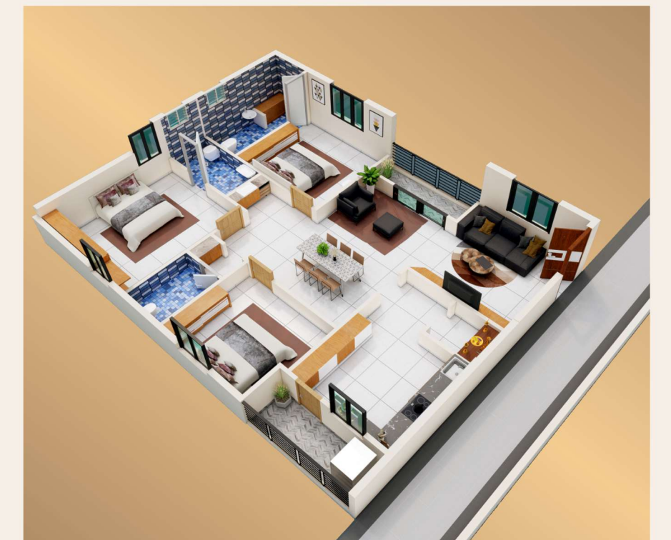
F NO. 09 - 1710 SFT - 3 BHK - EAST

A residence where every aspect has been carefully considered to create a refuge from the pressures of modern urban living and encourage a more relaxed outlook life. At Vk Suraksha every home within.