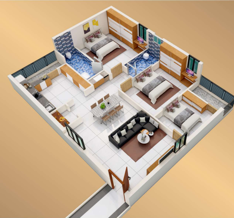
F NO. 06 - 1440 SFT - 3 BHK - EAST