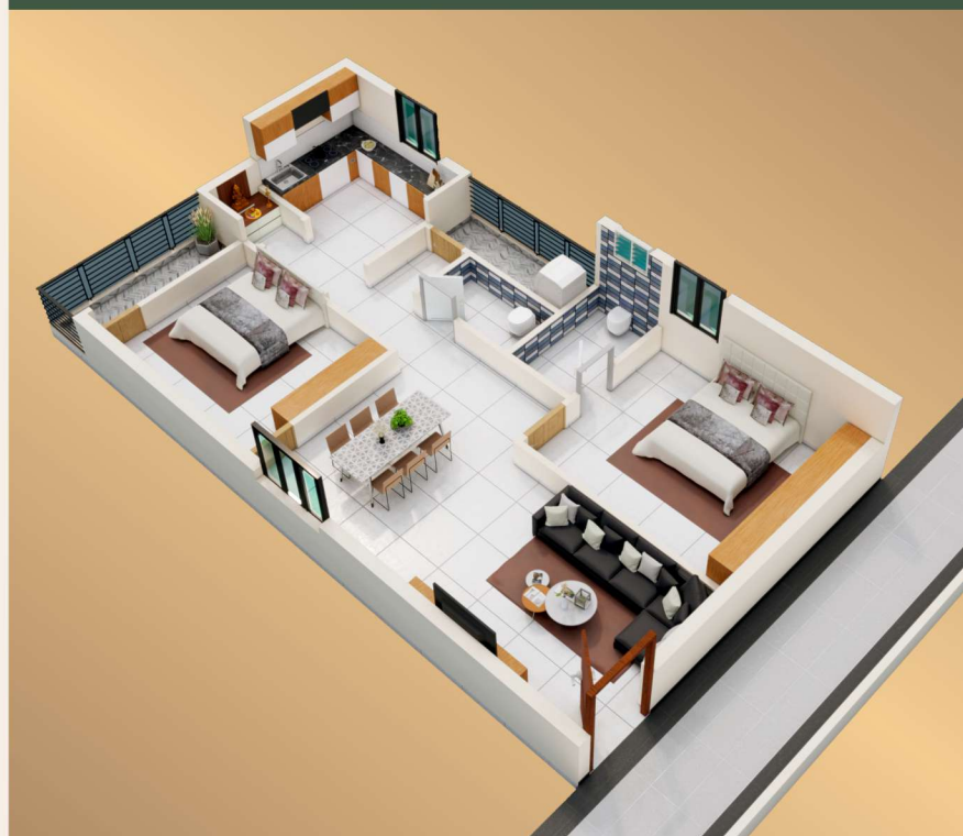
F NO. 02 - 1260 SFT - 3 BHK - WEST