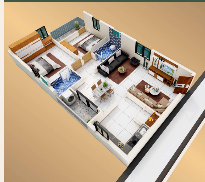
F NO. 07 - 1260 SFT - 2 BHK - EAST